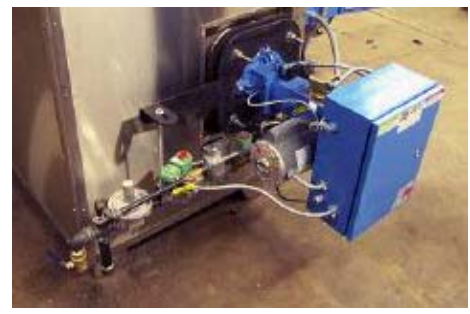
POWER BURNER -- SC55

Forced draft burner for positive combustion that maintains efficiency by minimizing the effect of air pressure changes around the evaporator. A power burner is the highest efficiency and most reliable burner that can be utilized on industrial equipment. Standard burners are manufactured to U.L./CSD-1 requirements.